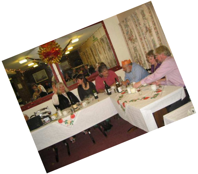
More Christmas dinner pictures!