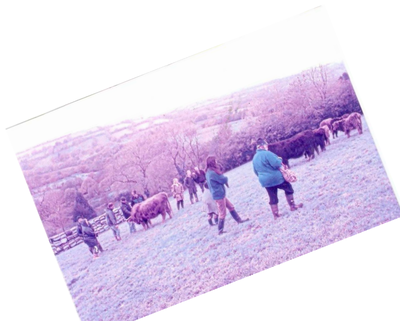
Meeting of Highlanders who like people and people who like Highlanders