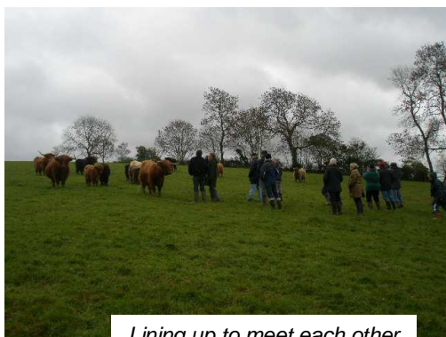
Lining up to meet each other

Most of the May cattle graze fields and sites on an 8 mile round trip, apart from the home farms. The minibus was an excellent idea because people were able to go on