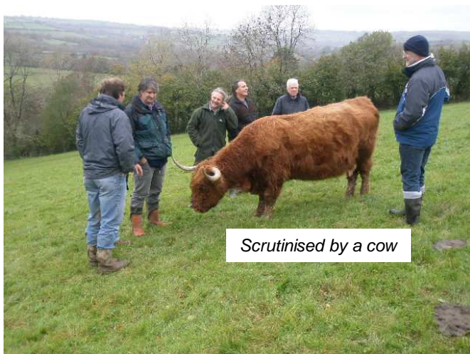
Scrutinised by a cow

The venue, Caer Cadwgan, was lovely and everyone was able to begin chatting over coffee as soon as they arrived.