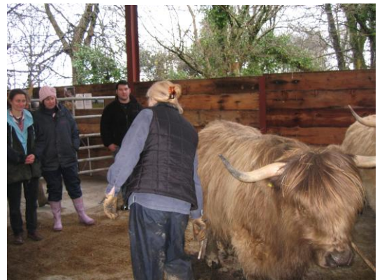
How to approach