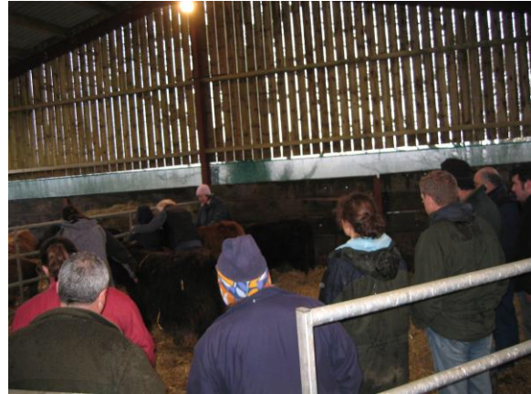
Demonstrating that handling is a matter of confidence